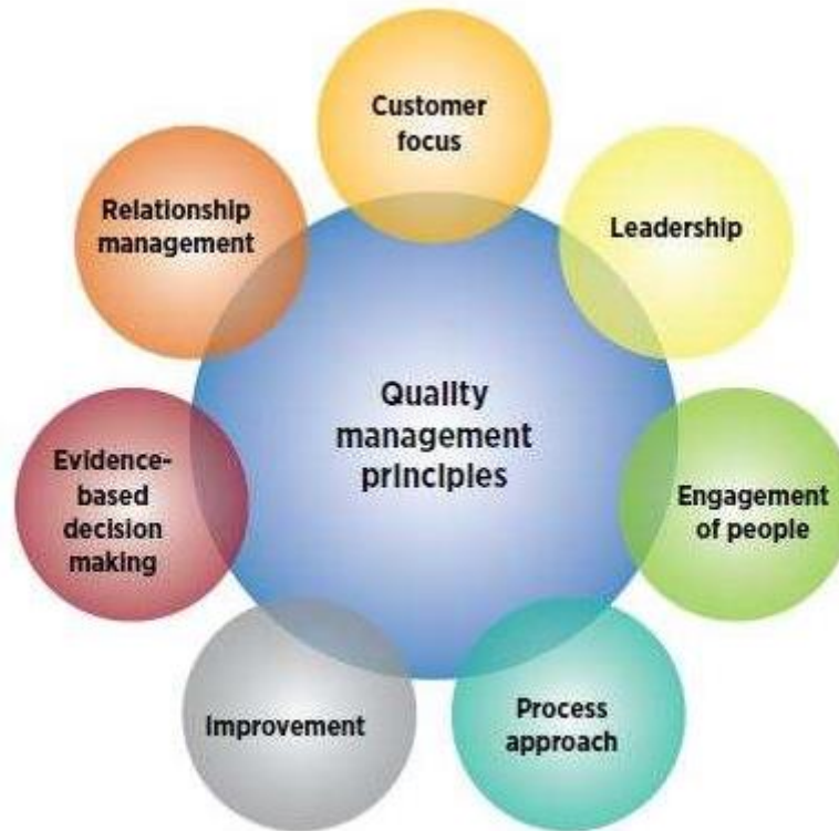
Quality Management System (QMS) Principles